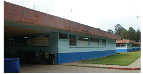
Santa Elena Hospital