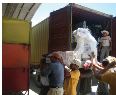
Equipment being unloaded.

A forty-foot container of medical equipment and hospital supplies donated by AMRF reached Guatemala on July 26, 2011 and was transported to Santa Catarina Mita, which is located in a remote mountainous region about 100 miles southeast of Guatemala City. This first shipment donated by AMRF will provide much needed equipment to support patient care in general medicine, maternity, pediatrics, as well as the outpatient clinics,